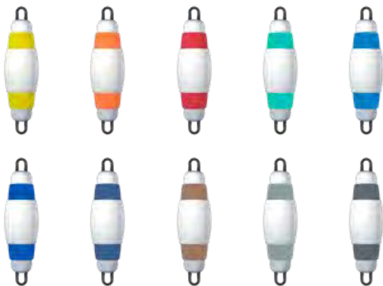
COLOUR EDITION – WHITE BASE