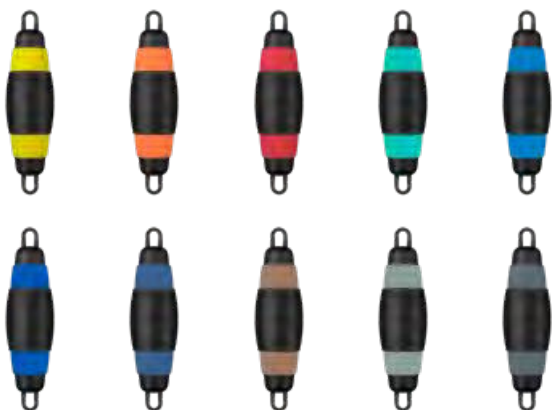
COLOUR EDITION – BLACK BASE